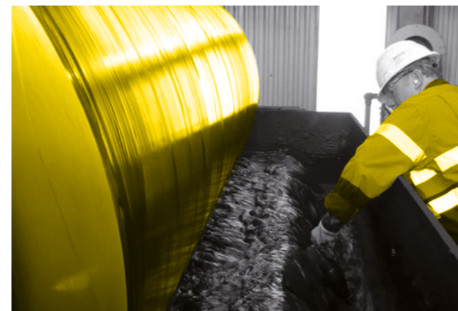
On-site audits and testing are some of the services we offer

At STEINERT, service doesn't end when your equipment is delivered – it marks the beginning of a reliable partnership for your long-term benefit. STEINERT understands the customer's diverse and regional requirements.